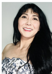
Hiromi Omura Soprano (Japan)